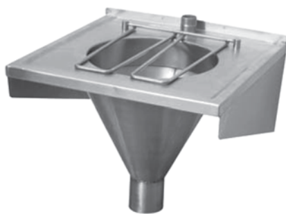
H3201 - Wall Mounted Slop Hopper (top inlet) H3202 - Wall Mounted Slop Hopper (back inlet) 600x600mm