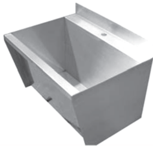
H37 - Taplanding Scrub-up Trough 480mm wide x 350mm deep

Scrub-up Troughs are manufactured in accordance with HTM64, from 1.2mm thick grade 304, satin polished stainless steel, supplied with brackets and 38mm plastic grated waste (in a left, right or central position). Available in any length, up to 3000mm, allowing approximately 600mm per person.