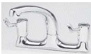
T9203 - Quarter turn 75mm lever sink deck mixer