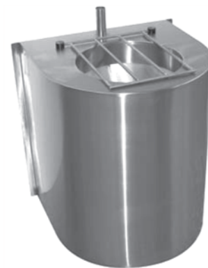
H3401 - Floor Standing Slop Hopper (top inlet) H3402 - Floor Standing Slop Hopper (back inlet) 600x600x600mm high