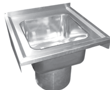
H3301 - Plaster Sink (without drainer) 600x600mm H3301 - Plaster Sink (with drainer) 1200x600mm