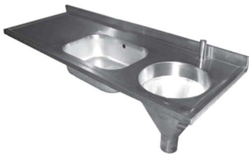
H3001 - Combined Sink/Slop Hopper (top inlet) H3002 - Combined Sink/Slop Hopper (back inlet) 1600x600mm

Slop Hoppers are manufactured in accordance with HTM64, from 1.2mm thick grade 304, satin polished stainless steel, supplied with anti-drip edges, brackets, top or back inlet 38mm flushpipe connection, 110mm spigot soil outlet and 38mm combined waste and overflow assembly. Alternative sizes available on request.