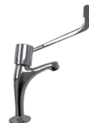
T9212 - Quarter turn 150mm lever sink taps