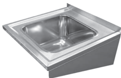
H3601 - Single Hospital Sink 600x600mm H3602 - Double Hospital Sink 1200x600mm

Manufactured in accordance with HTM64, from 1.2mm thick grade 304, satin polished stainless steel, supplied with anti-drip edges, brackets and 38mm standpipe strainer waste and plug. Plaster sinks also have a sump containing a pull-out basket and cover is fitted to the bowl. Tapholes as required. Standard overall size and layout can be altered and alternative bowl sizes are available. They can also be supplied as sit-on or inset tops.