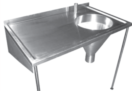
H3101 - Combined Slop Hopper/Drainer (top inlet) H3102 - Combined Slop Hopper/Drainer (back inlet) 1000x600mm